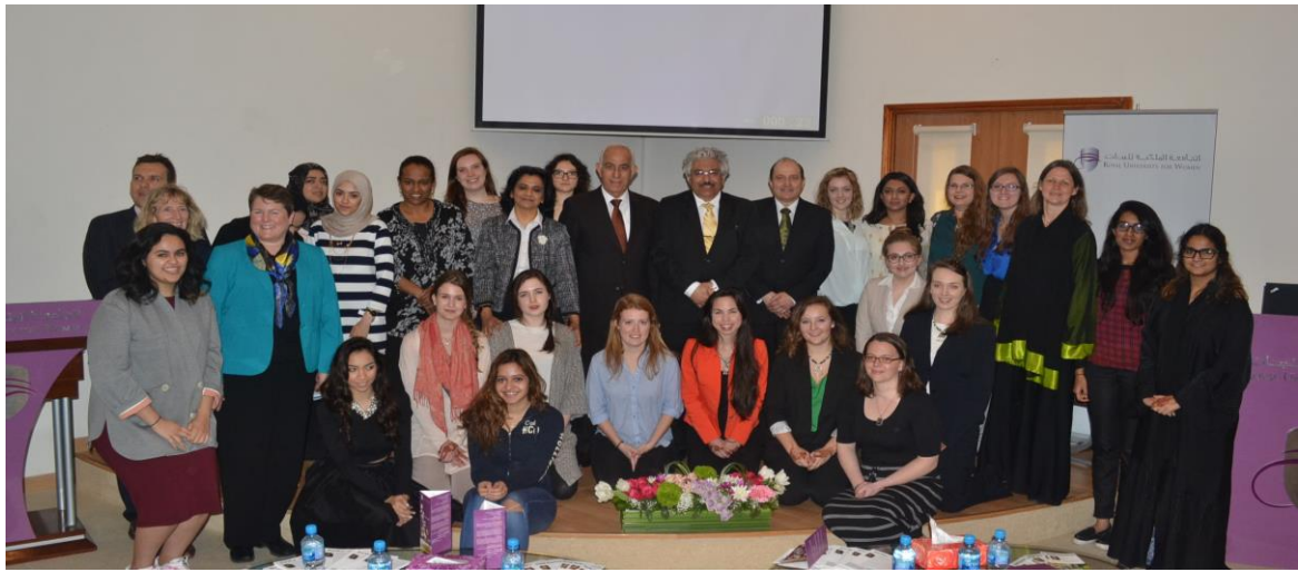
RUW, WVU, and Cambridge University Debate

forty students from British School of Bahrain and Sheikh Hessa Girls School participated in the event.