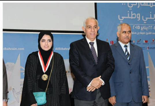
Graphic Design and Fashion design Teams receiving awards at Skills Bahrain