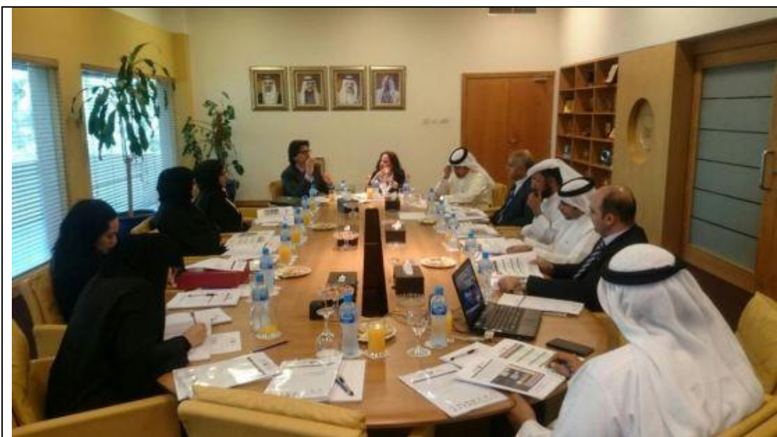
Web Design Skills Team at Skills Bahrain Training Center

Mr. Dagash participated as an expert and Judge in Bahrain skills competition (Web Design Skill team).