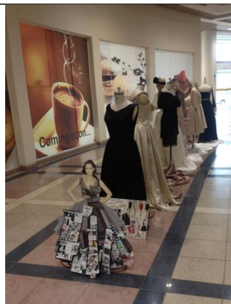
CAD's Exhibit at Al-Aali Art Fest, 2015