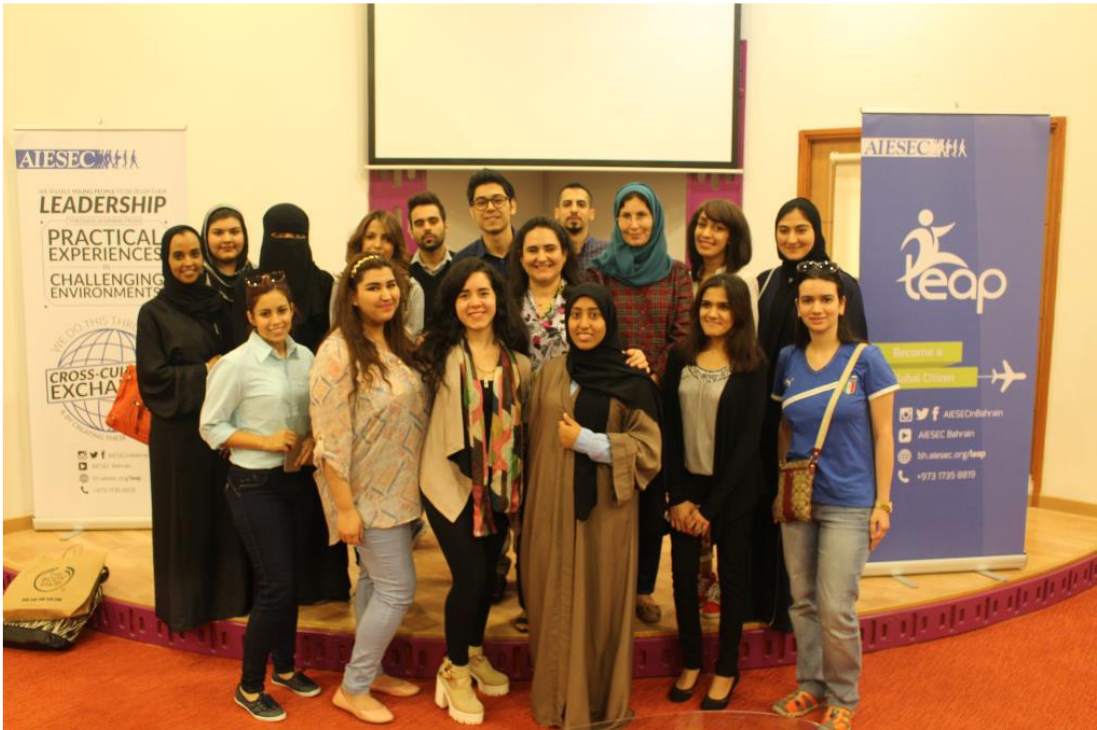
The AIESEC group, members of the RUW AIESEC club, Dean of CAD and CEC Chairperson, OSA manager, and RUW students during AIESEC presentation, Nov. 2015

CEC hosted the AIESEC event “Be more than a student with AIESEC” on Nov. 22nd, 2015. The event included a lecture and number of presentations by AIESEC members to introduce the programs of volunteering and Internships to RUW students. They also set up tables for further information and registration over a period of two days. The support for AIESEC has become an ongoing activity for RUW. There is an AIESEC club at RUW which continues to promote for AIESEC programs which encourage young youth volunteering and support of the community both locally and internationally. There are many programs that are part of this as LEEP, Cross-Cultural youth exchange, and others. The AIESEC club at RUW has become very active in recruiting RUW students to be part of these activities. The AIESEC team also visited RUW campus in April 2016 to promote for the summer youth volunteer programs.