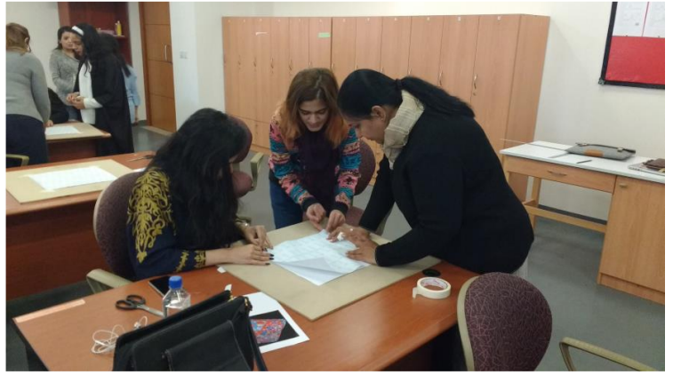
CAD student and Faculty members busy at work on the mural