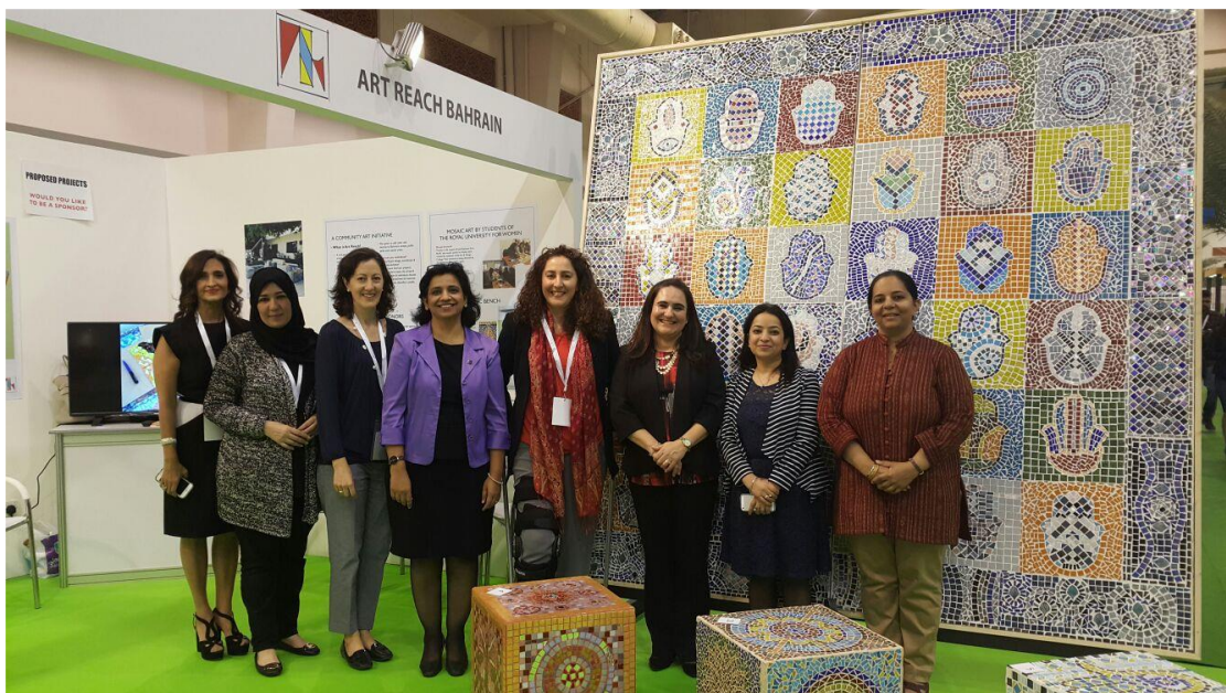
Exhibiting the Panel at BIGS “Bahrain International Gardens Exhibition”. Members of Art Reach Bahrain with RUW AVP, Dean of CAD, and CAD faculty members