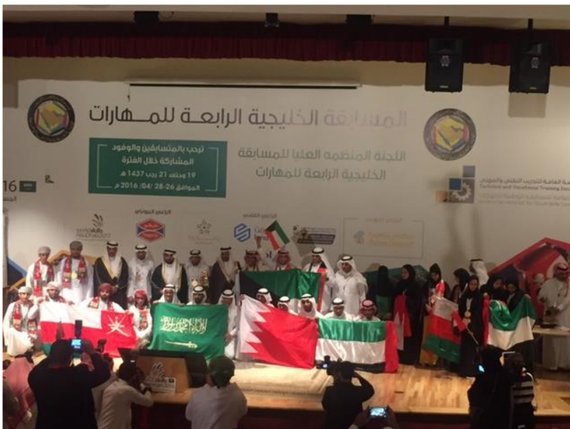
Prize awarding ceremony at GCC skills Competition, KSA