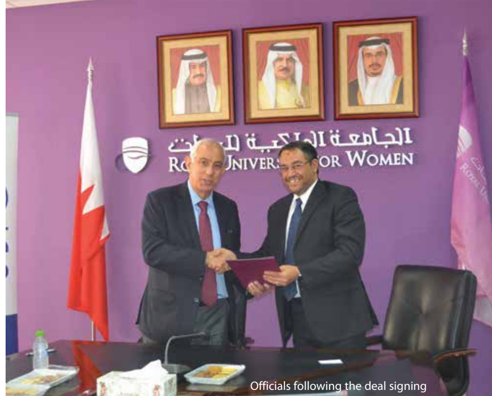
Officials following the deal signing