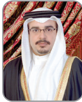
His Royal Highness Prince Salman bin Hamad Al Khalifa The Crown Prince, Deputy Supreme Commander and First Deputy Prime Minister