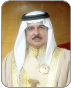
His Majesty King Hamad bin Isa Al Khalifa The King of the Kingdom of Bahrain